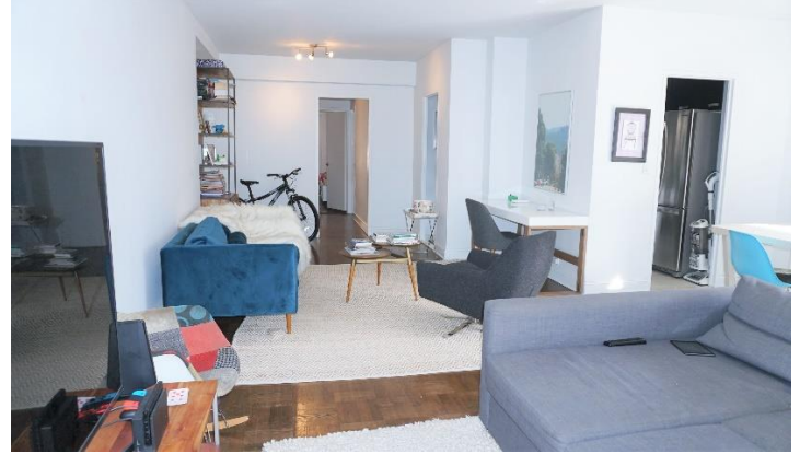
RE Taxes: $1,195